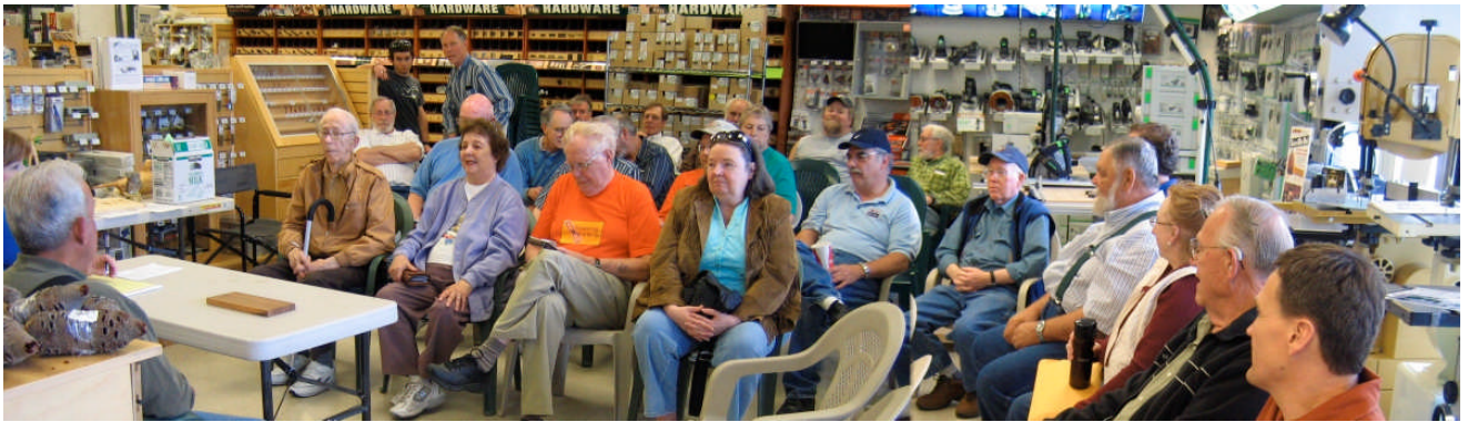
Carvers at May Meeting

meets on the second Thursday of each month September through May at 6:30 P.M. at the Woodcraft located in the Overland Park Shopping Center at 6883 Overland, Boise, Id, 83709, (208) 338-1190.