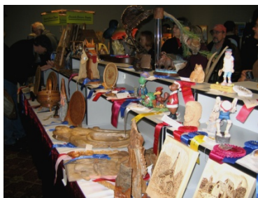
2010 Idaho Artistry in Wood Show