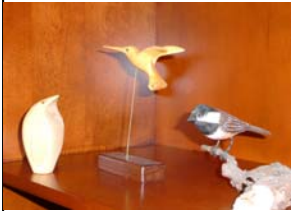
My first three carving projects