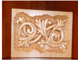
My fourth project was a relief carving of my choice