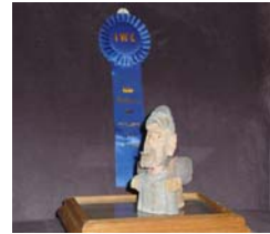
Civil War Soldier Bust