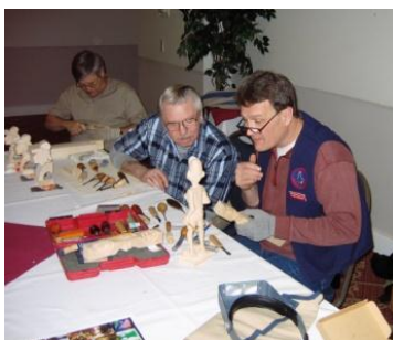
2011 Idaho Artistry in Wood