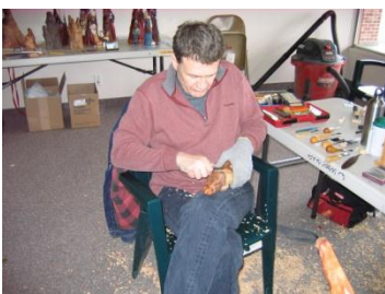
2011 Cypress Knee Class

"Someday we're gonna turn THIS burl, honey."